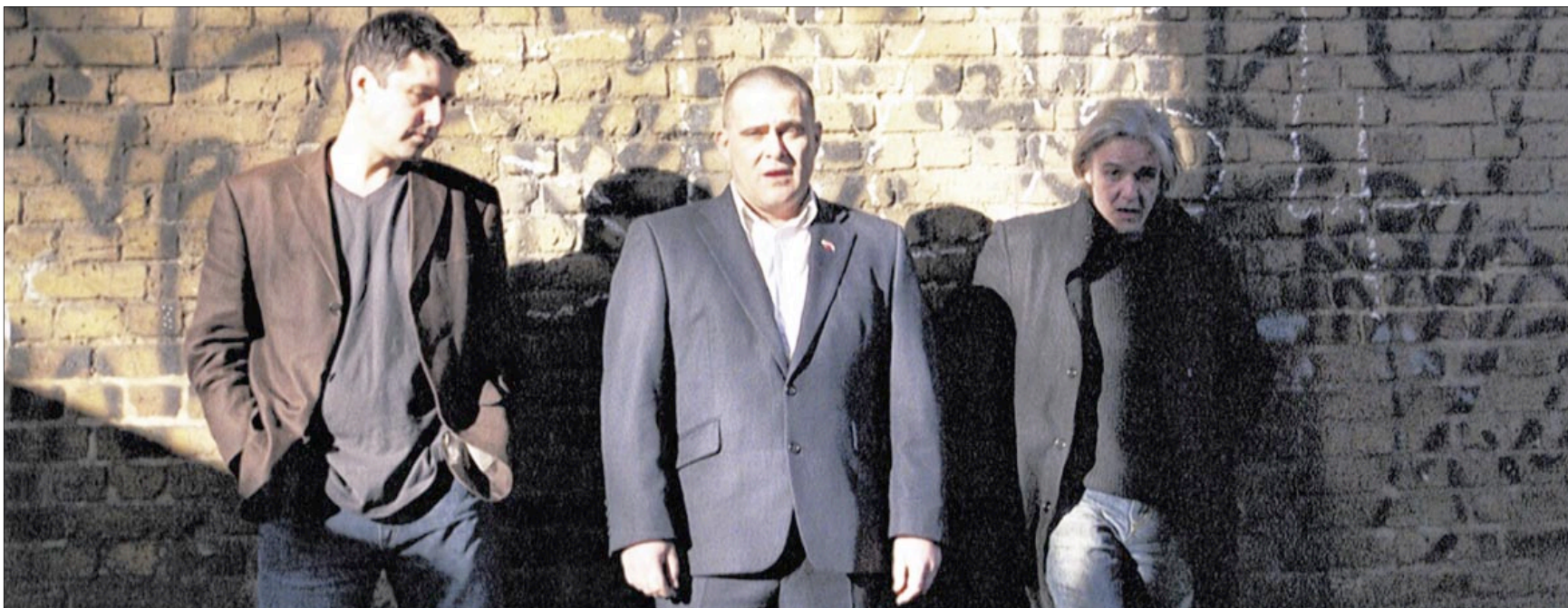
GIRD YOUR LOINS: The Singing Loins are set to release their 11th album, Stuff

THE Medway Little Theatre has had to postpone its production of Mina after rehearsals were disrupted by snow and ice. The performances have been rescheduled to the weekend of March 12 and 13 at 7.30pm. All those who had booked for the original dates should contact the box office to re-book.